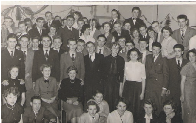
W H Allens' Christmas party 1953. Held in the canteen

Things were still strict and the menus were quite plain but wholesome and filling. Most days we served stew and dumplings or a steamed meat and onion roll, cottage pie or meat pasties, liver and bacon, Spam fritters and a special which was roast beef or pork etc. All served with a choice of vegetables such as cabbage, swede, carrots, mashed potato or chips. On Fridays it was always fish and chips. Also sweets - steamed jam roly-poly, Dundee puddings, jam sponges, apple pies, all served with custard.