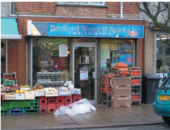
Kimbers' shop as it is now.

Bridgman's also sold wet fish. It used to fascinate me how Eric got a piece of paper and quickly folded and turned it into a little cone shape. He'd then twist it a few times at the bottom and fill it with winkles. You'd pick them out of their shells with a pin... it was a lot of work for not very much.