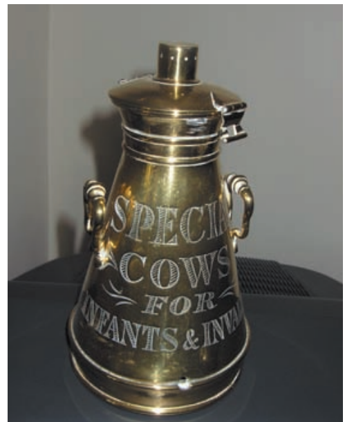
Milk churn hung on the front of Humphrey's milk cart

The school milk was carried into the classrooms in a big crate and the bottles were smaller than a half a pint. They had rotten little round cardboard tops and you'd press down in the middle and pull them out with your finger. The teacher would say, 'Who wants it warm?' and these bottles would be stacked along the top of old metal radiators ready for break time.